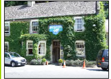
The Swan Hotel

The Catherine Wheel Public House Arlington Tel: 01285 740250 Pub food