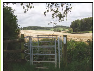
A Country Stile