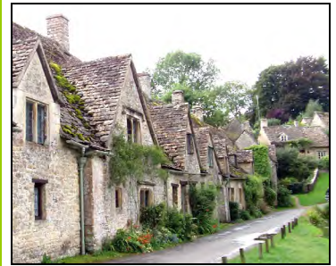
Cottages En Route

As with all water meadows, this path can become waterlogged after heavy rain. If this is likely, you may wish after the little wooden bridge, D , to go straight across the field to the gate and return by the outward route back to the start point, S .