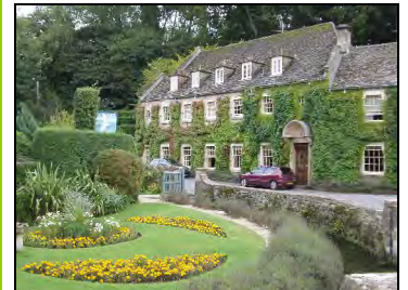
Elegance in Bibury