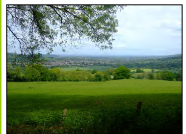
A Fine View Near Winchcombe