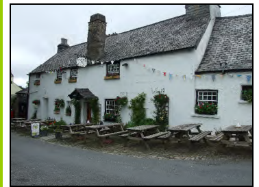
The Royal Oak

The Royal Oak Public House Meavy Pub offering snacks and meals