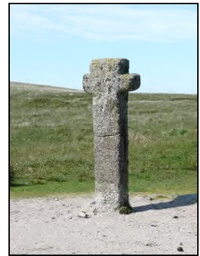
Nun's Cross Also known as Seward's Cross