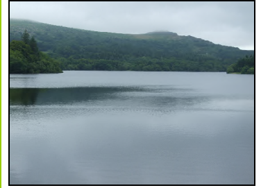
The Burrator Reservoir

Return to E , and follow the distinct path to Ditsworthy Warren House with the River Plym keeping company to the left. Follow the path around the house to take the path initially leading west, then moving to north-west and climbing Ringmoor Down. A gate G is reached with a signpost indicating Public Bridle-path to road and Ringmoor Cottage.