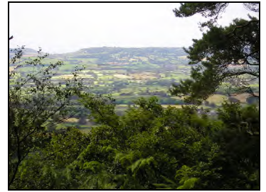
View From Lewesdon Hill

Follow this track to a waymarked gate, go diagonally left to a gate in the top left hand corner. Cross a field to a gate on your left in the opposite hedge. Cross a green lane and walk straight ahead across a field to a gate. Turn left to reach a road. Turn right along the road to a junction with the B3164, turn left to return to Broadwindsor Square. S .