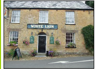
The White Lion

Broadwindsor Craft and Design Centre Licensed restaurant and tea rooms Broadwindsor Tel: 01308 868362 Lunches, light snacks, cream teas