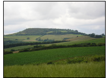
Pilsdon Pen Hill