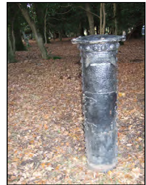
The Black Post Box