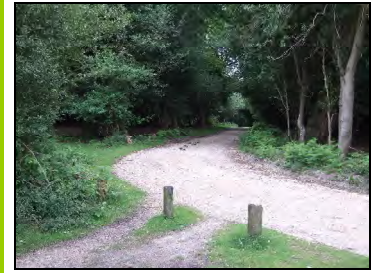
The Trail To Frogham

The track emerges at the B3080. Turn right along the road verge, for 700 metres, before turning right again, at F . Passing through the barrier, head towards the trees and continue walking in a south-westerly direction. Where three tracks converge at G (not reflected on the map!), turn abruptly left onto an indistinct pathway heading downhill into the valley. Ford the very shallow stream, which should not be a problem if wearing walking boots, and continue ahead. Turn right onto the cycle trail.