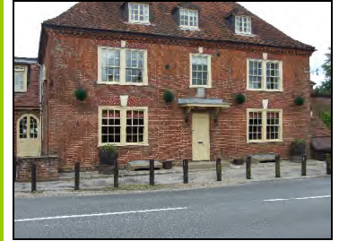
The Bell Inn

The Bell Inn Public House Brook Tel: 02380 812214 Village pub with snacks & meals