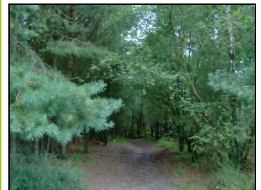
The Wooded Path