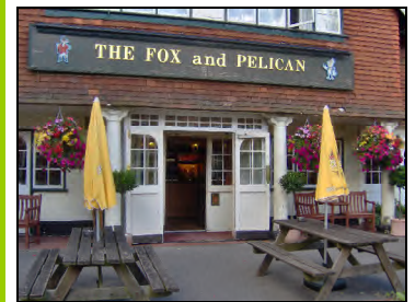
The Fox & Pelican

The Fox & Pelican Public House Headley Rd. Grayshott Tel: 01428-604757 Ales & bar food