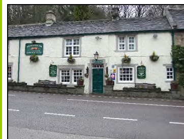
The Chequers Inn

Goose Green Tea Rooms Tea rooms The Green, Baslow Tel: 01246 583000 Hot and cold meals