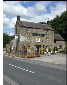
The Cliff Inn

The Jovial Dutchman Public House Cromford Road, Crich Tel: 01773 852421 Meals and bar snacks available