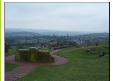
A Grandstand View